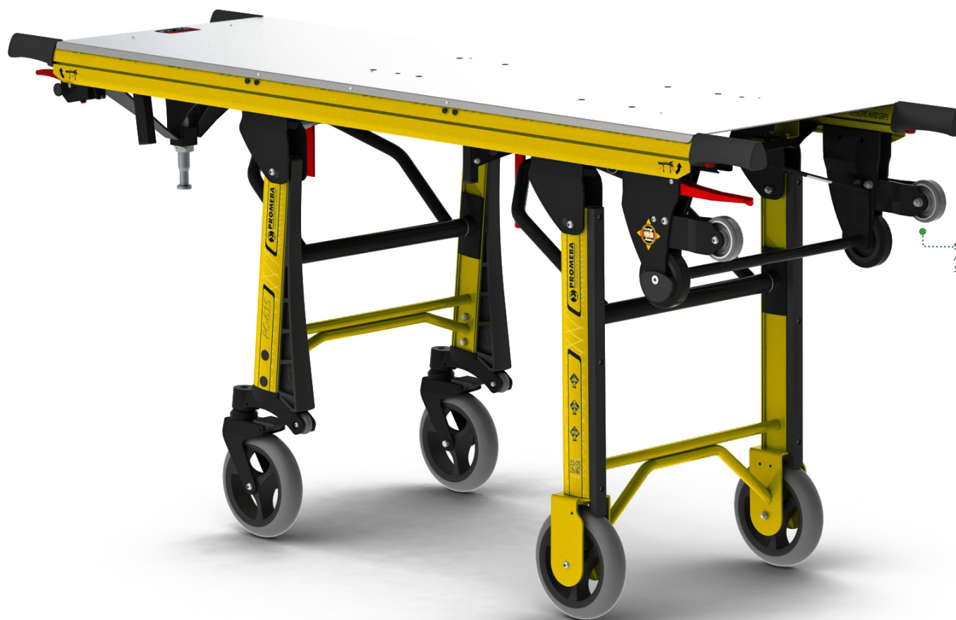
SISTEMA AJUSTABLE ADJUSTABLE SYSTEM SYSTEME REGLABLE